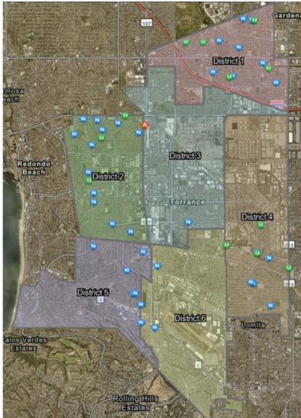
(A) 12pm – 8pm (N) 8pm – 6am (U) UNKNOWN