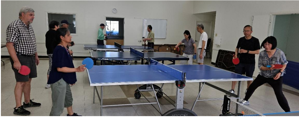
Ping Pong players enjoying Walteria Senior Center