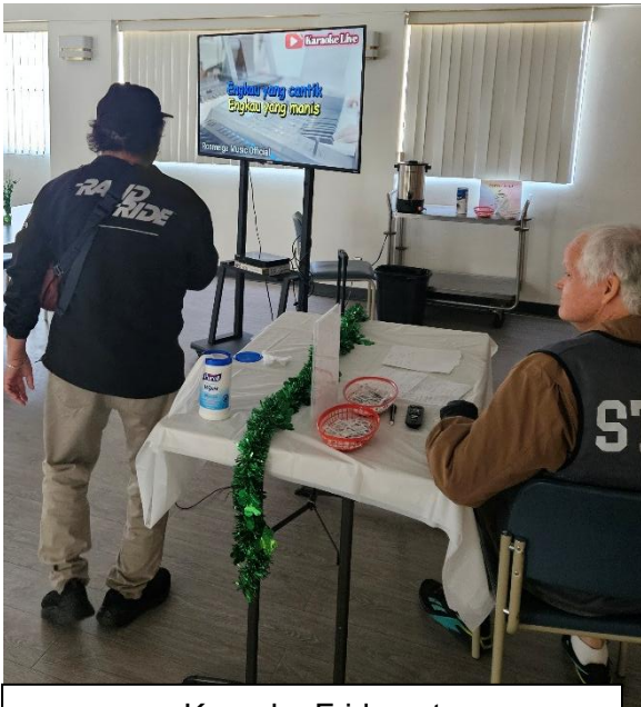
Karaoke Friday at Bartlett Center