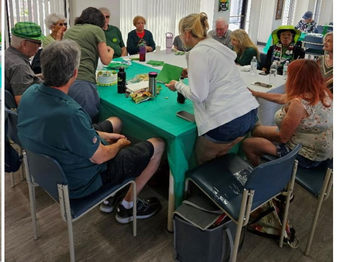
St. Patrick's Day Luncheon at Bartlett Center