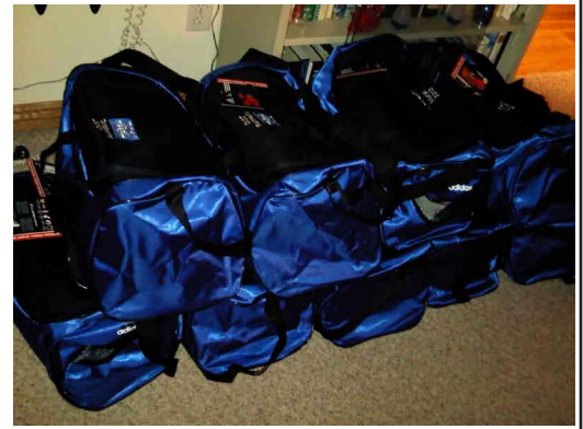
The gift bags we gave to the Kashiwa folks.