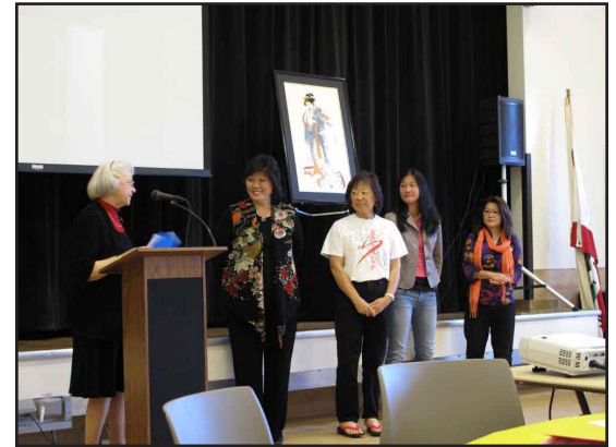
Installation of new officers