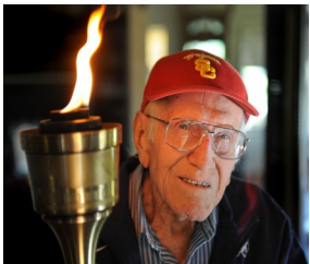
Torrance's hometown hero at the 1998 Olympic Games in Nagano, Japan

Louis Zamperini went from being a juvenile delinquent in Torrance to a high school, college, and Olympic track star. A child of immigrants, he was often in trouble with the authorities, until a police officer suggested that he use his fleet feet for sport instead of mischief. By the end of high school in Torrance, Zamperini had become a world-class runner, setting a world high school record in the mile. He qualified to run on the 1936 Olympic team by