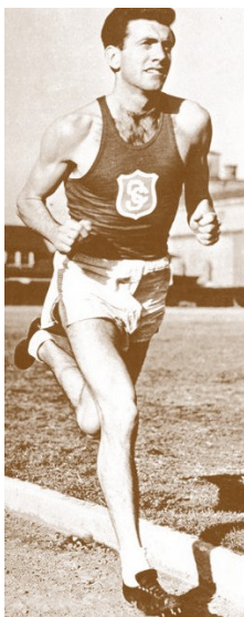
Zamperini in 1936 from the Torrance Historical Society.

Zamperini on Saturday, April 28, 2012 at the Toyota USA Automobile Museum, Torrance.